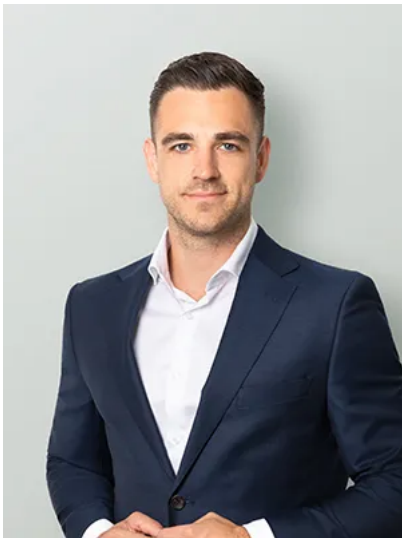
Rhys Digance Belle Property - GLENELG3 Recent Sales