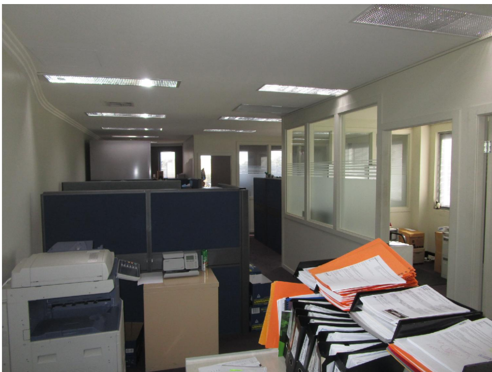
INTERNAL VIEW OF SUITE