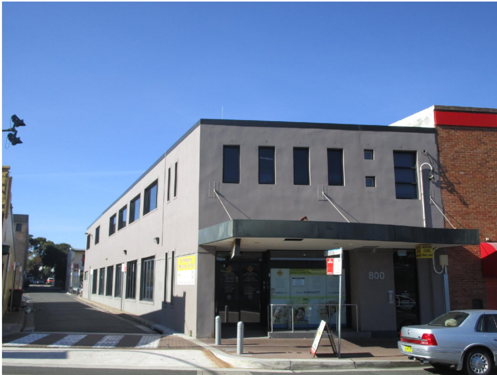
800 OLD PRINCES HIGHWAY SUTHERLAND