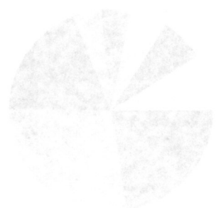
Allocation of your portfolio