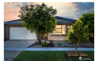
16 Portrush Loop