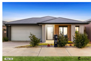
20 Tenterfield Street