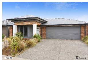
37 Middleton Road