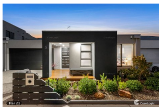
3 Madeira Street