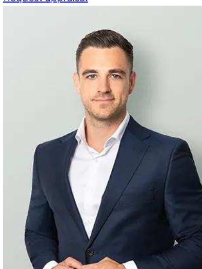
Rhys Digance Belle Property - GLENELG3 Recent Sales Request appraisal