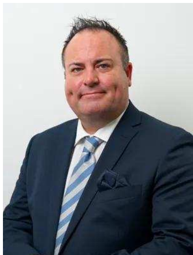
Heath Laphorne Taplin Real Estate - RLA 1836, 994, 2061, 1660, 2197, 2226 - GLENELG17 Recent Sales Request appraisal

You don't have to be ready to sell to get an appraisal. Speak to an expert to find your potential sale price and better understand the local market and selling process.